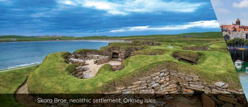
Skara Brae, neolithic settlement, Orkney Isles